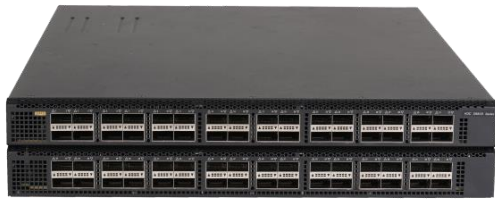
S9820-64H front view