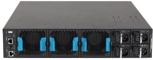
S9820-64H rear view