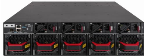
S9820-8C rear view