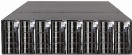
S9820-8C front view

The switch supports 8 subslots, each card can provide up to 16 100GE ports or 4 400GE ports, S9820-8C provides up to 128 100G ports or 32 400G ports in total.